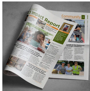
2022 Impact Report