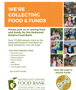
Food & Funds Flyer