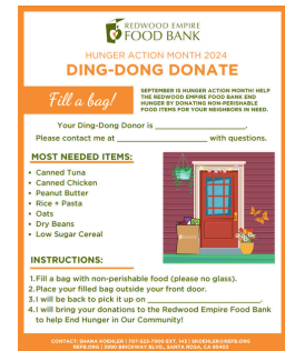
Ding Dong Donate Flyer

If you can't stop by in person, you can download the materials here .